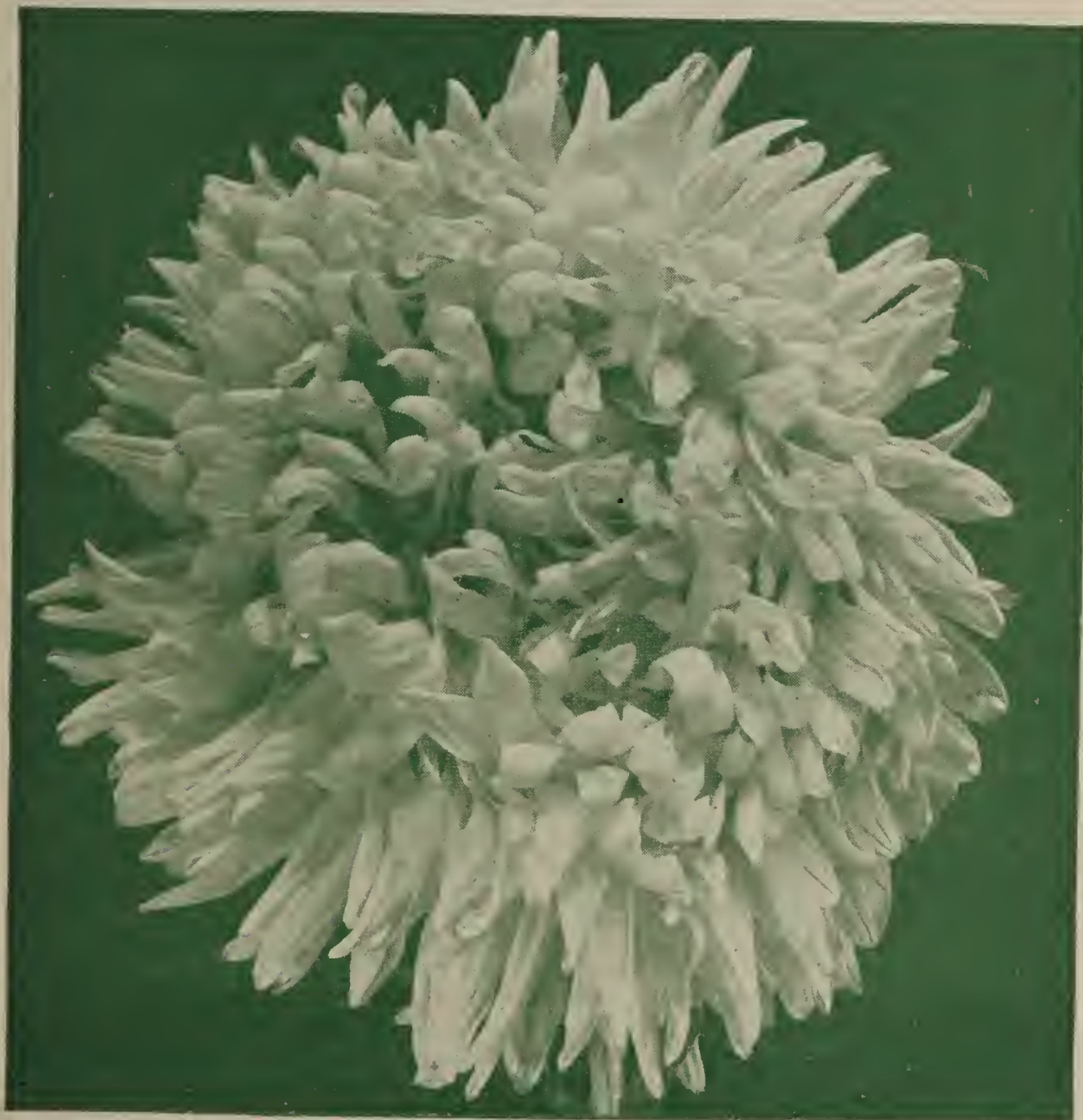
Aster Giant Mammoth Paeony Flowered Silvery Rose

Above varieties, per pkt., 25c. (For "New Deal" price see page 12.)